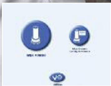
Home Page Display