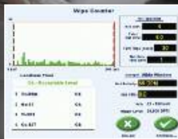
Wipe Count - Passed