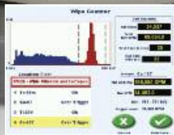
Wipe Count - Failed