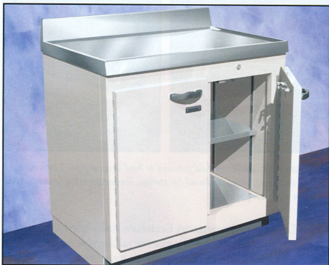
Built to support the Preparation Enclosure

T his Cabinet is designed to support the Lead-Lined Preparation Enclosure. Full height, overlapping double doors with key locks open to an adjustable shelf with a 100 lb capacity. The cabinet may be used for decay and storage.