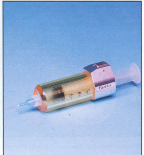
Pro-Tec® IV Syringe Shields are made from EXTRUDED lead glass... stronger than cast lead and still optically clear from tip-to-tip.